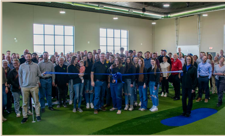
RJ's Indoor Golf Ribbon Cutting