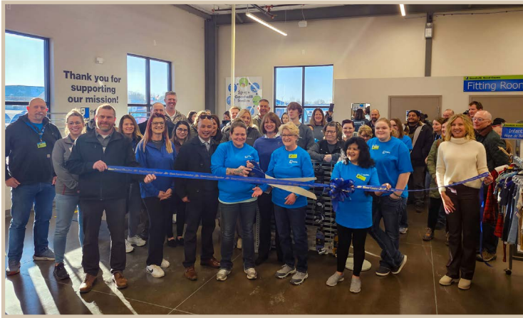
Goodwill of Great Plains Ribbon Cutting