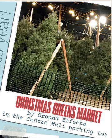
CHRISTMAS GREENS MARKET by Ground Effects in the Centre Mall parking lot