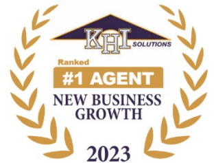
KHI Solutions Partners in Excellence Grow Your Business Award