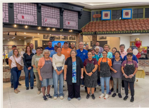
Casey's Bakery Anniversary Chamber Coffee