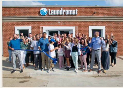
Fresh Wash Ribbon Cutting