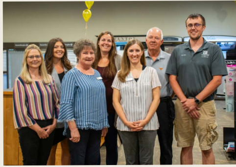
Vander Berg Homes 40th Anniversary Chamber Coffee

It's been a busy month of milestones! We've loved celebrating our members' anniversaries and ribbon cuttings!