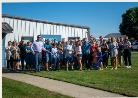
M Design & Promotion Ribbon Cutting