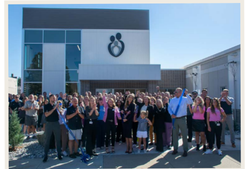
Promise Community Health Center Ribbon Cutting