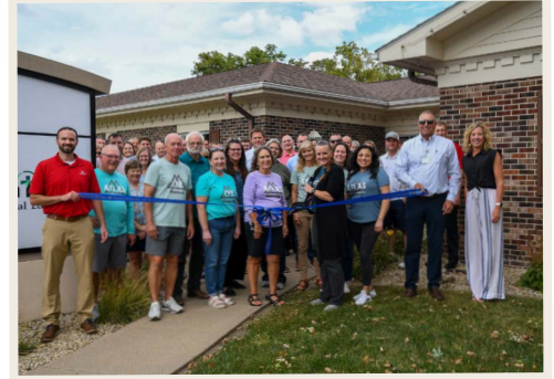
ATLAS & CFE Ribbon Cutting