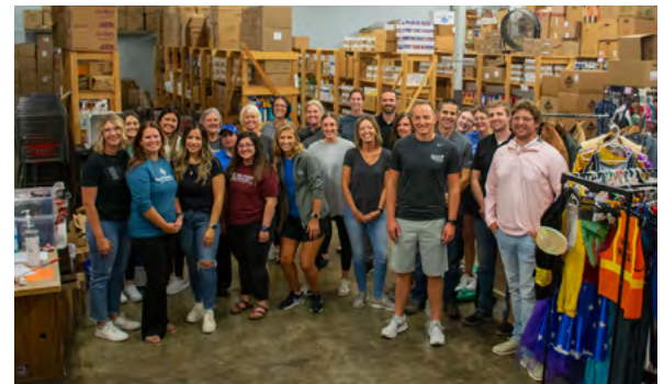
Reach Out Opportunity