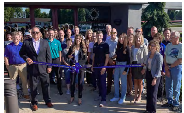
Center Benefits Ribbon Cutting