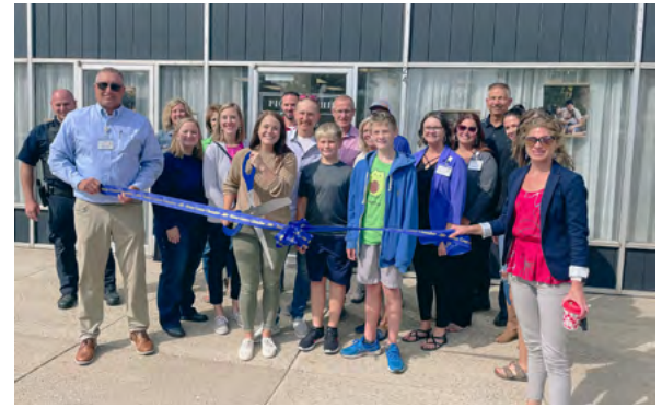
Picture this Photography Ribbon Cutting