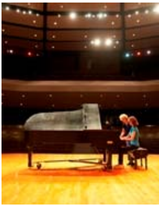
BJ Haan Auditorium Stage

We know that the success of your event is important to you and your group.