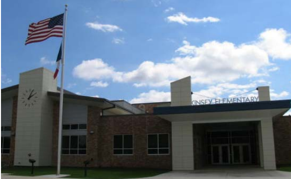
Kinsey Elementary School 397 10 th Street SE Sioux Center, IA 51250