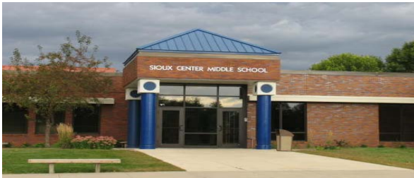
Sioux Center Middle School 950 4 th Avenue NE Sioux Center, IA 51250