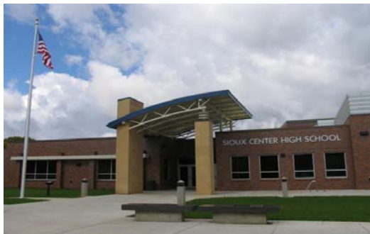
Sioux Center High School 550 5 th Street NE Sioux Center, IA 51250