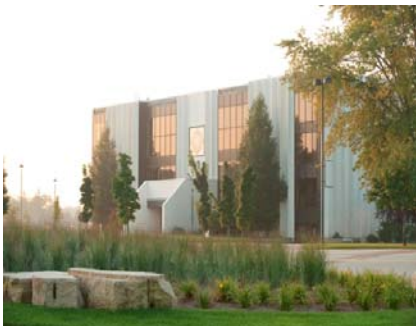
BJ Haan Auditorium

Dordt offers you a professional mix of efficiency and expertise along with personal service. Our years of practical experience help us match our resources to your needs. Our team makes sure your event is just what you hoped it would be. Whatever you require, we'll give you the support you need before, during, and after your event.